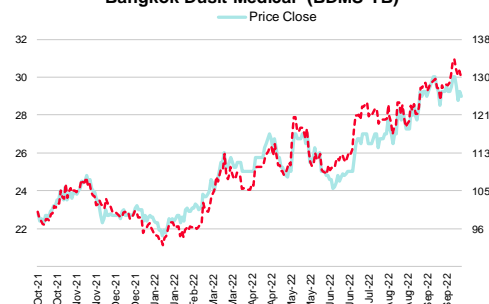
Bangkok Dusit Medical (BDMS TB)